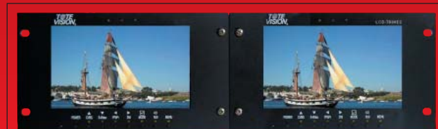
LCD-703HD2 Dual Rack Mount Unit